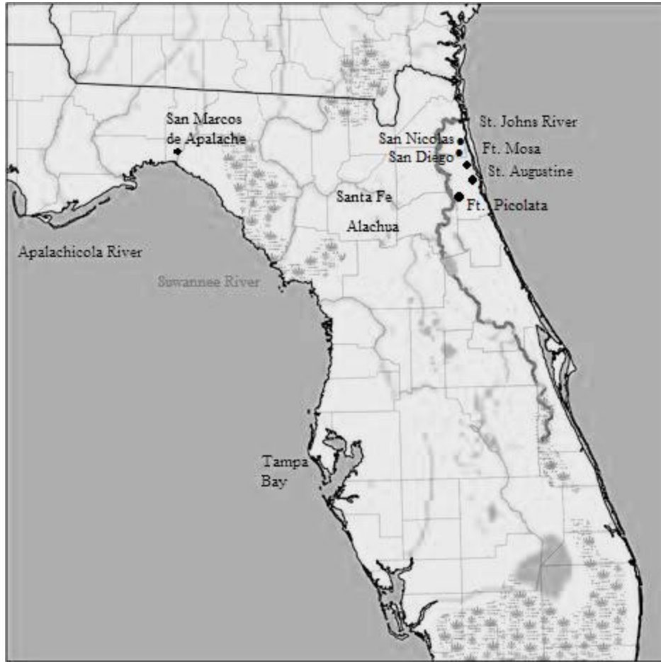
Figure 2. A Map of Florida